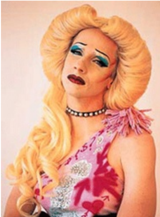
John Cameron Mitchell as Hedwig in Hedwig and the Angry Inch